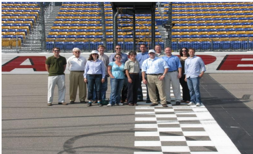
Tour Participants stand on Iowa Speedway Track after learning the positive influence of ethanol in professional racing.

The tour was designed to “fuel the truth” on issues ranging from food and fuel, gas prices, E15, advanced biofuels, greenhouse gas emissions, distillers grains, seed research, crop yield trends, sustainable practices in agriculture and renewable fuels production, legislative and regulatory policy, and the future of biorefining.